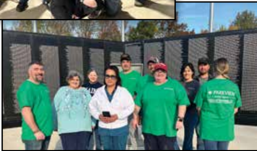
Parkview Veterans Group

On September 13th BAE systems volunteered at the Shrine once again. October we had several volunteer organizations including the Geocache Group on October 5th, the Parkview Veterans group on October 18th and the Bishop Luers Football Team on October 25th. Thanks to these great partners the Shrine continues to shine! We really appreciate your efforts.