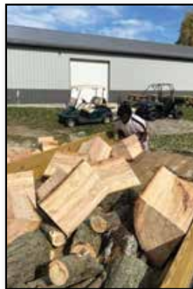
Bishop Luers Football