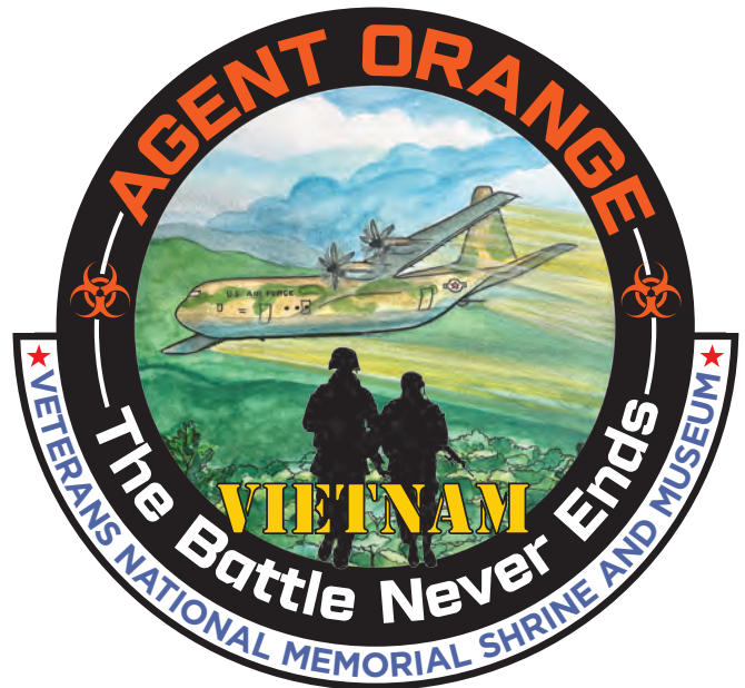
Patch designed for the Agent Orange Memorial Fundraiser.

mailing a check to Veterans Memorial P.O. Box 26 Arcola, IN 46704.